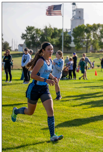
TOP LEFT: Frederick Area runners take off with the pack at the start of the Region 1B varsity race on Oct. 16.