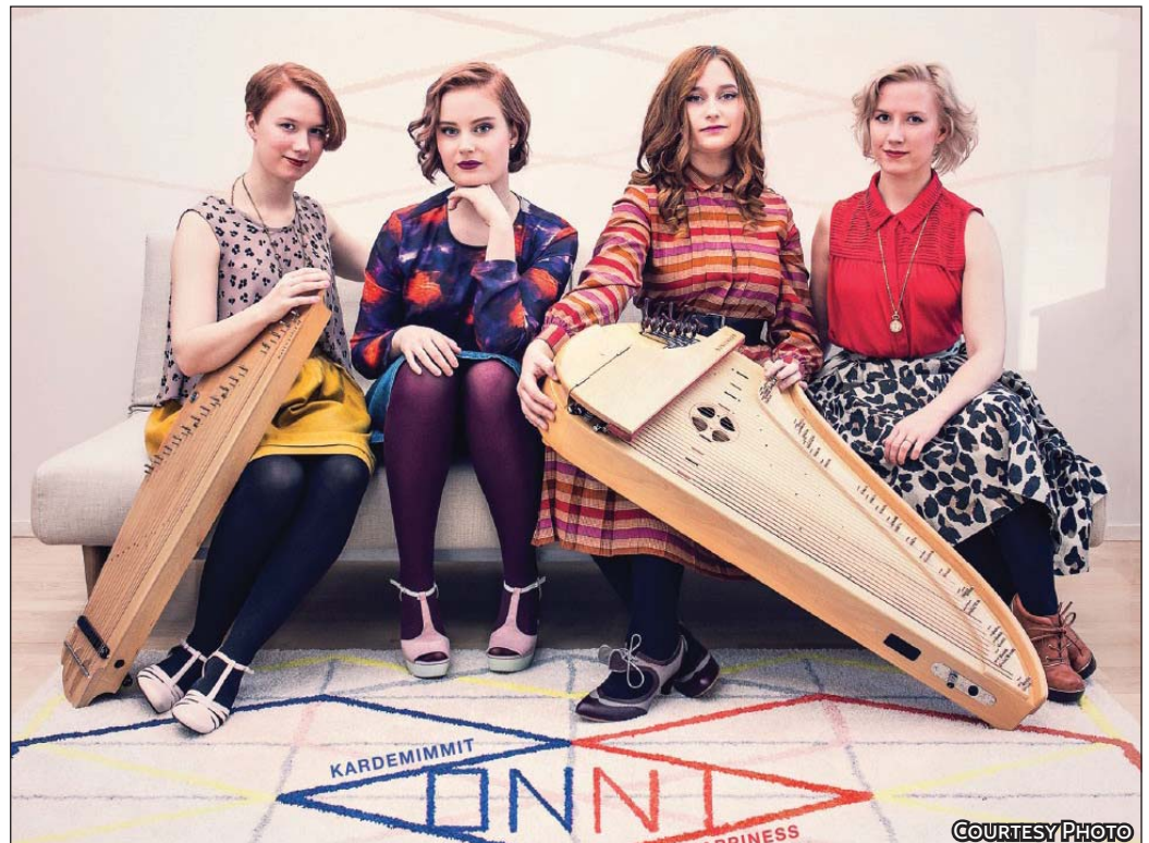
Finnish group Kardemimmit will perform in Frederick, SD on Friday, April 6th at the Frederick Area School. In addition the Frederick Area School invites all to come for a pre-concert community pot-luck. The pot-luck meal is set for 5:30pm to be followed by a concert at 6:30pm.

The Finn's are coming to Frederick! On Friday, April 6th, the Frederick Area School, in partnership with the Aberdeen Area Arts Council, will be hosting a concert by the Finnish group Kardemimmit.