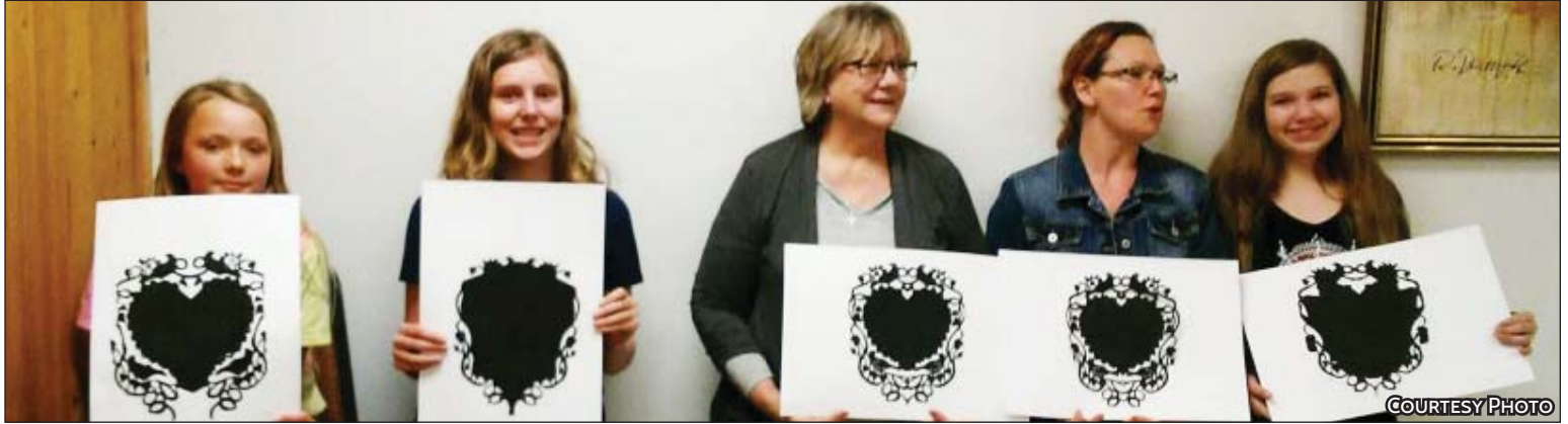
Crafter's Clubbers pose with their art work after an enjoyable evening together at Titan's Restaurant in Frederick, SD.