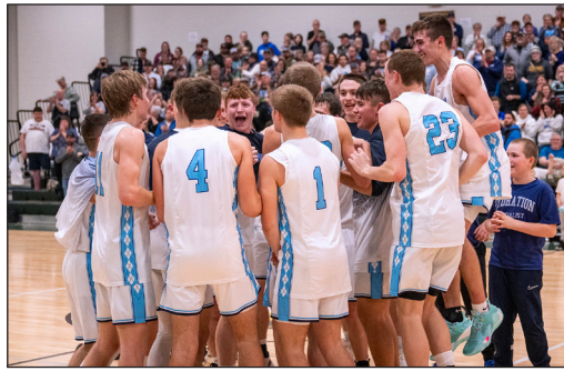
The Titans celebrate after receiving their State Qualifier plaque.

www.frederickarea.k12.sd.us www.FrederickSD.com Frederick Area F.Y.I., P.O. Box 533, Frederick, SD 57441