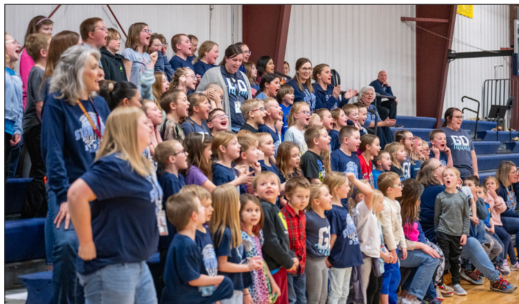
The pep rally ended with the whole school—elementary on the left, middle school and high school on the right—giving their “V-I-C-T-O-R-Y” battle cry.