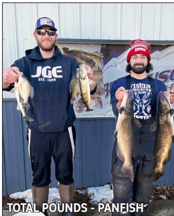
TOTAL POUNDS - PANFISH