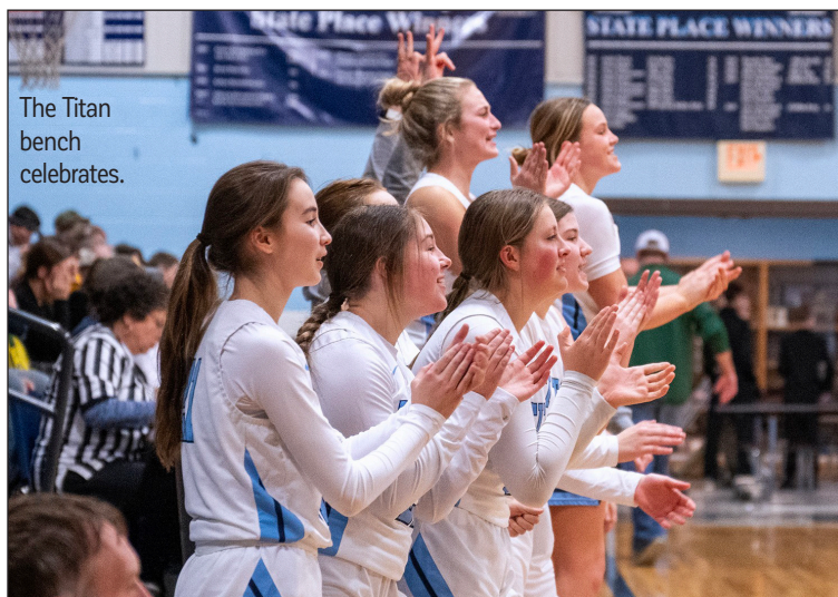
The Titan bench celebrates.