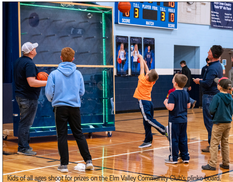
Kids of all ages shoot for prizes on the Elm Valley Community Club's plinko board.