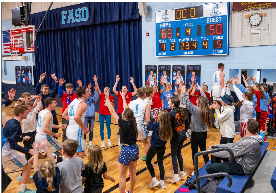
The celebratory human tunnel to the locker room has become a frequent sight at the end of Titans' games.