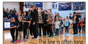
The line is often long.