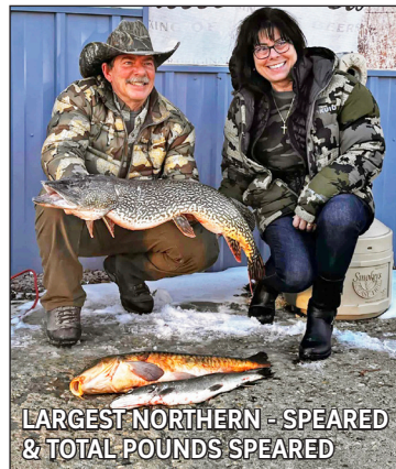
LARGEST NORTHERN - SPEARED & TOTAL POUNDS SPEARED

Under beautiful skies and in great temperatures, a record number of 132 teams competed in the 16th Annual F-5 Fishing Tournament on Jan. 27 at Elm Lake.